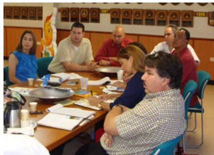
Tourism Officials visit the headquarters.